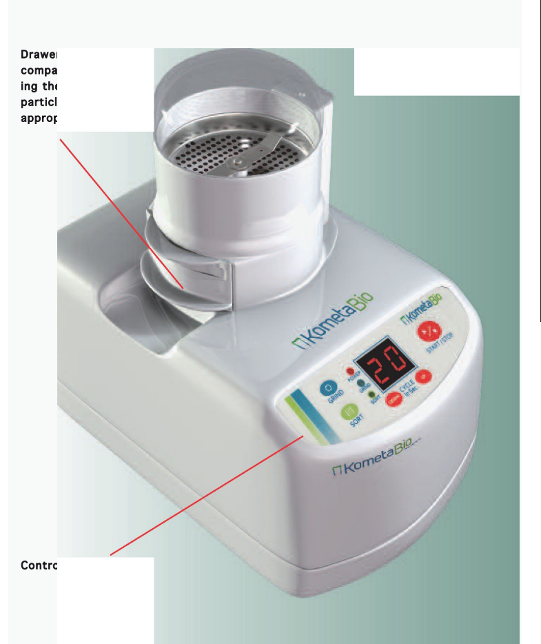
Smart Dentin Grinder: Tooth grinding and dentin particulate sorting system. The 250 to 1200 µm particles are collected in the drawer and then decontaminated before being re-implanted in the tooth socket for an autologous graft.